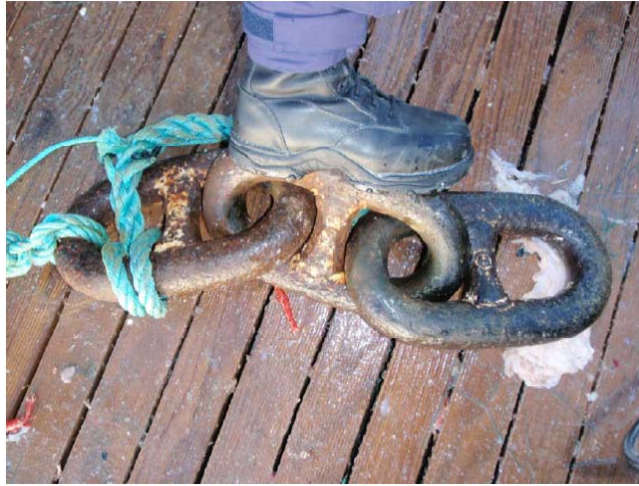
Chain links to weight gillnet.