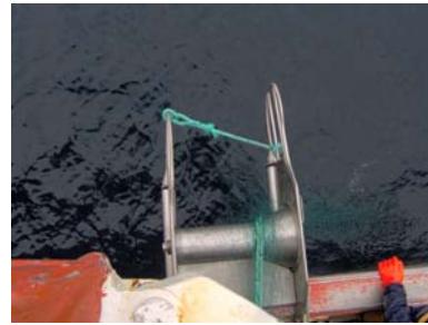
Figure 2: Guide to haul a gillnet over the side inboard.