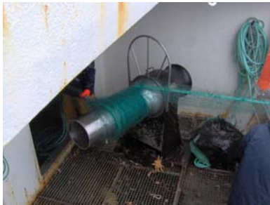
Figure 1: Drum or net roller used to haul in the gillnet.