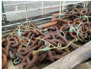
Figure 3: Chain links used to anchor the net.